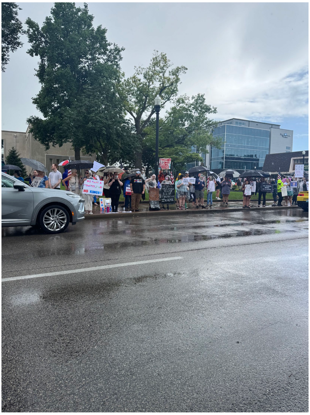
\mbox{NO\ KINGS\ Rally} – Protesters stood strong in a downpour to defend democracy and demand real representation.