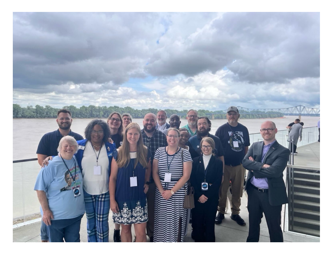
Riverfront Recharge – Delegates united by the water, sharing a moment of reflection amid a weekend of action.